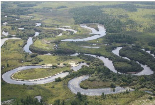
Figure 1. The shifting habitat mosaic of a river in Russia.

Through time, growing riparian vegetation reinforces islands and bars while dead vegetation inputs large amounts of wood into the river, further redirecting the river's course.