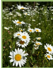
Noelle Orloff, MSU