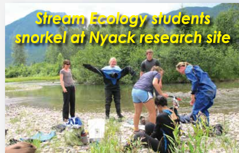
Stream Ecology students snorkel at Nyack research site

Consider taking an academic adventure to the Crown of the Continent in northwest Montana for a phenomenal field ecology experience in a truly spectacular natural setting!