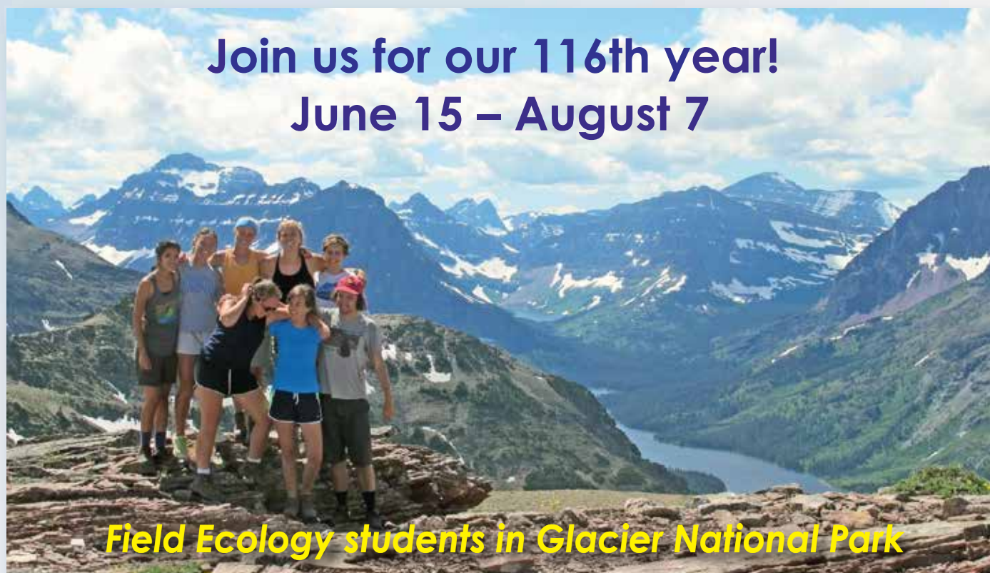
Field Ecology students in Glacier National Park

Join us for our 116th year! June 15 – August 7