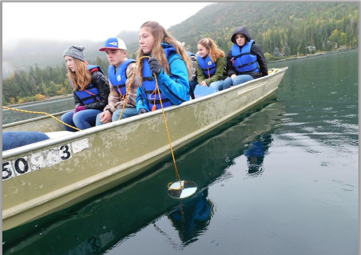
Measuring water transparency with a Secchi disk.

How clear is Flathead Lake? Secchi disks are one tool that scientists use to measure how far light penetrates the water. Secchi depth measurements have been recorded consistently (usually monthly) at the Flathead Lake Mid-Lake Deep sample site since 1977. Citizen scientists have collected Secchi depth data around Flathead Lake during the local Secchi Dip-In event promoted by the Flathead Lakers and FLBS for the past couple of years. The North American Lake Management Society's annual Secchi Dip-in has been collecting Secchi depth data from lakes across the United States since 1994. Thanks to these organizations, communities are able to learn more about the lakes' water transparency and how it changes over time.